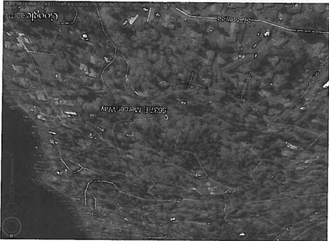
Photo # 1: A Google Earth image of the site and the surrounding community.

While the lot is large by Mercer Island standards, the buildable portion of the lot is small due to an active stream, stream buffer, and steep slope area. Therefore, only those trees in the immediate impact area are included in this report. The other trees will be protected by the "Limits-of-Disturbance" fences.