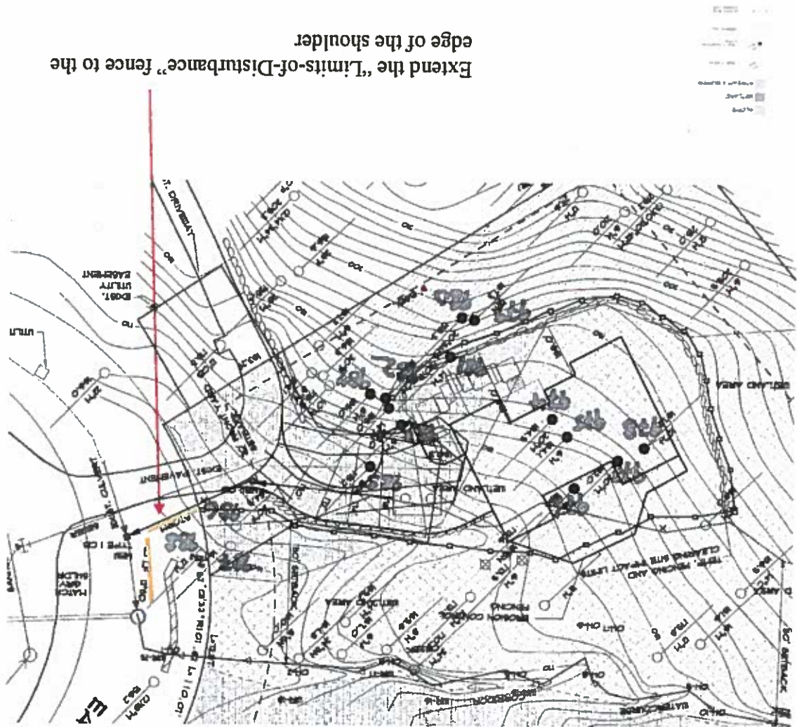
Extend the "Limits-of-Disturbance" fence to the edge of the shoulder