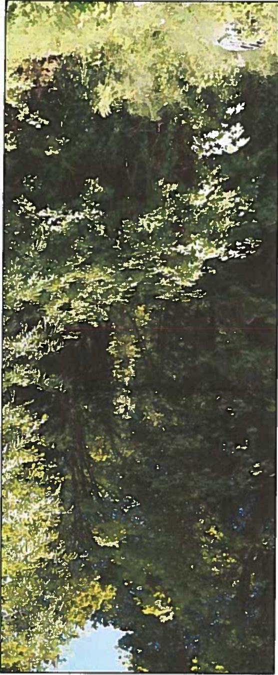
Photo # 2: A view from the shoulder of E Mercer Way looking up into the wooded lot that is 5637.

There are a few invasive species spread across the entire ravine that encompasses multiple properties. A few individuals are on the subject property. They include English Ivy, English Holly, English laurel, and Himalayan blackberry.